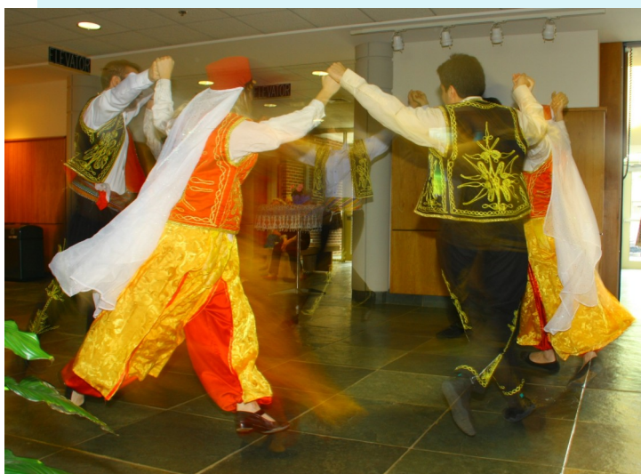
Entertainment was generously provided by the Turkish dance group, Turquoise. Other volunteers wrote guests' names in Hindi, Farsi, Thai and Korean.