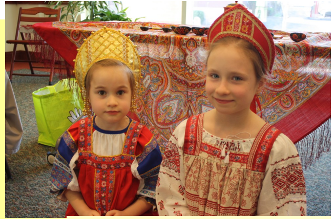
Russian traditional dress for Tales in Many Tongues—Russian story day in March.

Global Connections teamed up with Young Scholars Charter School, the Center for Global Studies at Penn State and Schlow Centre Region Library to offer Tales in Many Tongues in a new collaborative community program at Schlow this year. The program featured adults from other countries reading stories in their native language to young children ages 3—8 and their families, as part of the library's "World Stories Alive" program.