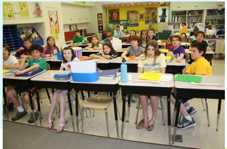
The Corl Street class demonstrates their "I need help" eyes.

Global Connections can craft service learning or cultural understanding programs for your classroom or diversity committee, as well as provide international speakers to discuss their countries and culture. Call us at 814-863-3927 or email us at globalconnections@ip.psu.edu .