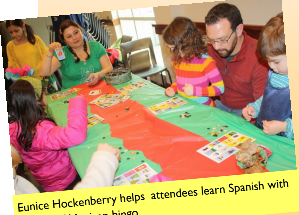
a game of Mexican bingo.